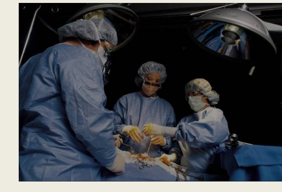
Figure 2. Label in 24pt Arial.