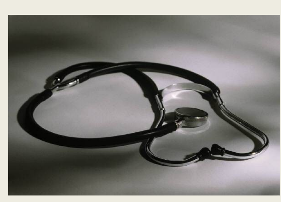
Figure 1. Label in 24pt Arial.

This text box will automatically re-size to your text. To turn off that feature, right click inside this box and go to Format Shape, Text Box, Autofit , and select the "Do Not Autofit" radio button.