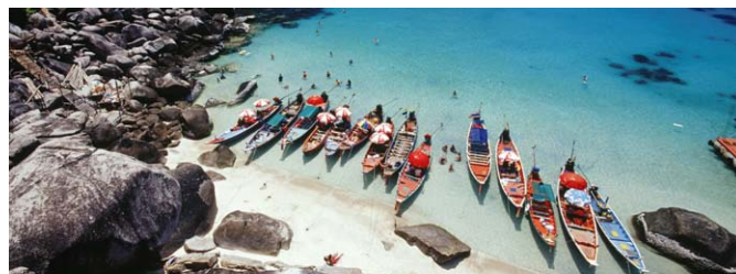
Phuket Island, Thailand

The world's sun worshippers converge on Phuket's beautiful beaches and tropical beauty. Others go to experience the island's hospitality and rich culture. You'll find ancient temples, exciting elephant rides, shopping galore, mouthwatering Thai cuisine and even thrilling cabaret shows.