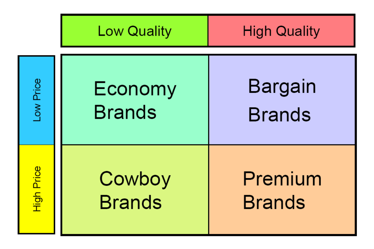
Figure 2"Product Positioning Map"