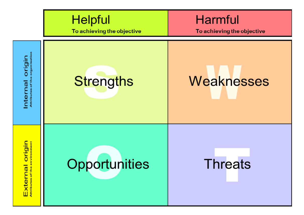
Figure 1 "SWOT Analysis"